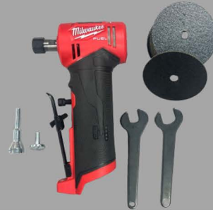
Right Angle Die Grinder, Mandril Set & Cut off Wheels