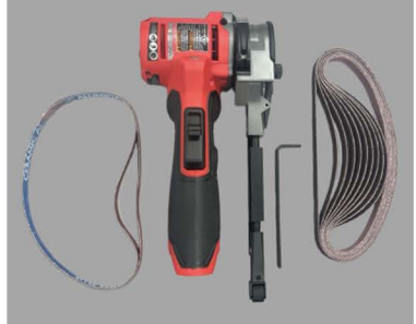
Band File & Sanding Belts