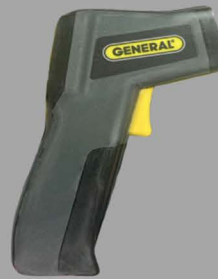
EM-TG Infrared Temperature Gun