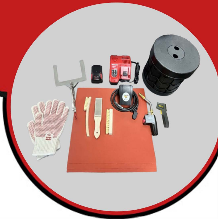
EWK-S/U Electronic Ignitor Accessory Kit for U-series cartridges

To support operations who have selected Exothermic welding as their preferred method of conductor connection, MCS offers complete Exothermic Starter Tool Kit options to ensure each customer has all the necessary equipment and supplies to smoothly complete their cable repairs using this method. Items include special manufactured tools to ensure proper hold and placement of conductors within molds, mold preparation, cleaning, and temperature products. In addition, equipment includes electronic ignitor and power tools required to complete successful exothermic weld procedures.