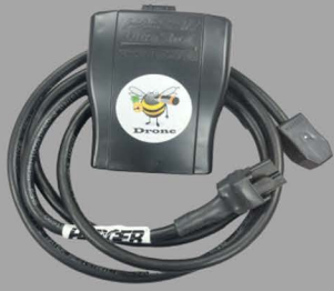
EID-U Electronic Ignitor. Does not include battery