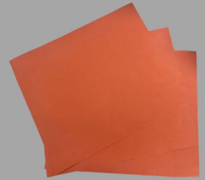
PFB-01/3 Conductor Protective Blanket. Set of 3