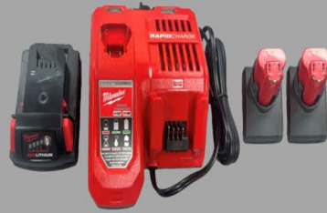
Rechargeable Batteries & Rechargeable Battery Station