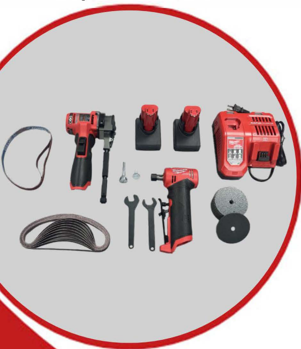
EWTK-001 Shop Power Tool Kit