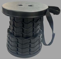
EMS-STAND Adjustable Stand to support mold at proper height