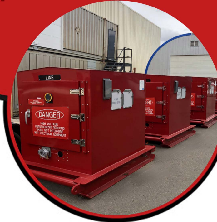
15kV or 25kV Skid Mounted Junction Boxes

An alternate connection system to electrical couplings, each 15kV or 25kV Skid Mounted Junction Box is CSA certified and features a Nema 4 rated enclosure manufactured on a heavy duty, towable skid framework. Custom manufactured to suit individual customer requirements, each 15kV or 25kV Skid Mounted Junction Box features roof mounted insulator and buss bar assemblies to accommodate Posiclamp to Posipin or terminal lug direct to buss bar connection. Available entrance options include strain relief, or split entrance plates as required by each operation. Standard features include electrical hotstick, roller arm microswitches for added operator safety, and rugged tow hooks for easy relocation on minesite operations. Each 15kV or 25kV Skid Mounted Junction Box design can accommodate single or double cable runs.