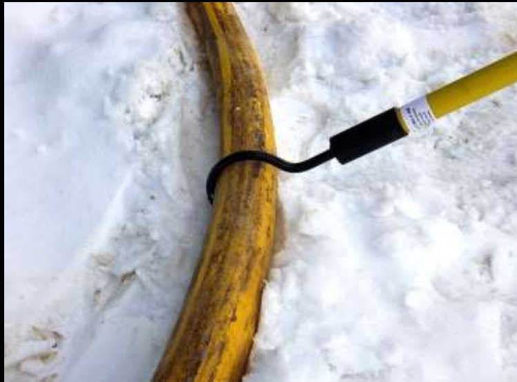
Cable Handling Hookstick with Single Hook