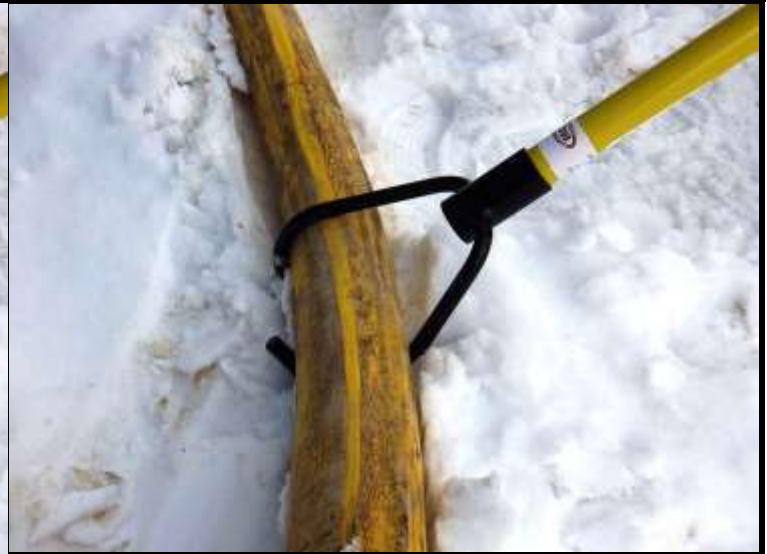
Cable Handling Hookstick with Double Reversing Hook

Mine Cable Services Cable Handling Hooksticks are designed for use in the mining industry as a method of handling energized electrical cable supplying draglines, shovels, drills, and other minesite equipment. A lightweight design offered with a variety of hook styles, fiberglass insulated shaft at varying lengths, and handle options allows you to create the Hookstick model that is most preferable for your application. Cable Handling Hooksticks are tested to 60kV DC and are suitable for use with cables ranging from 600V to 25kV.